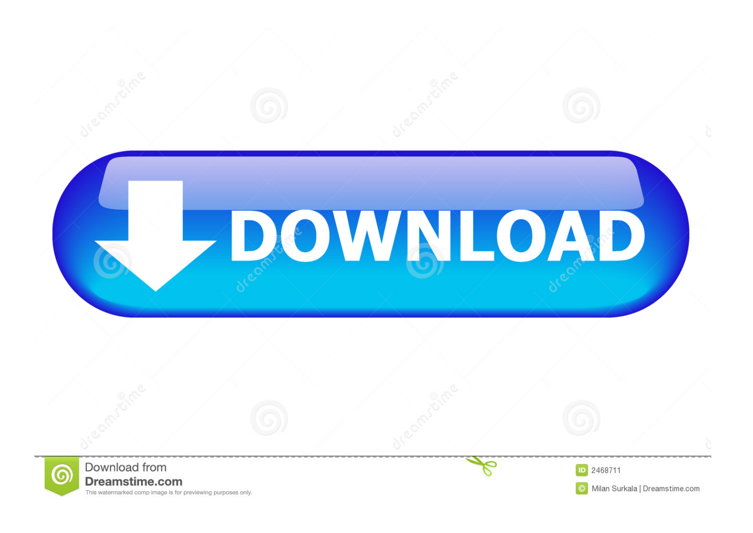
Call Of Duty Black Ops 4 Game For PC Highly Compressed Free Download